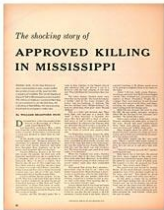
WILLIAM BRADFORD HUIE

Taken from PBS.com http://www.pbs.org/wgbh/amex/till/sfeature/sf_look_confession.html